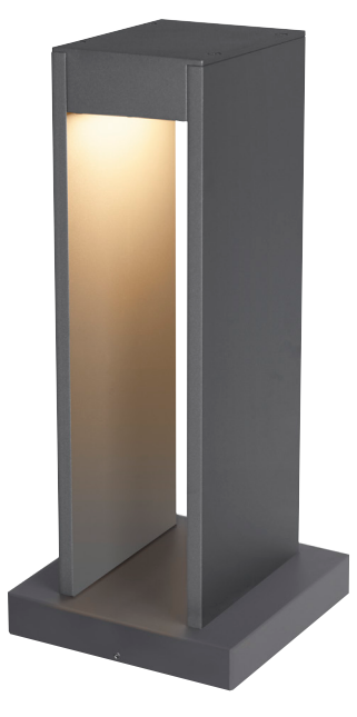
SYNTRA PATH shown in charcoal