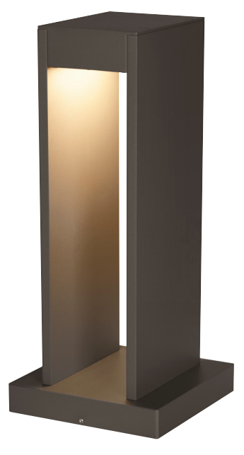
SYNTRA PATH shown in bronze