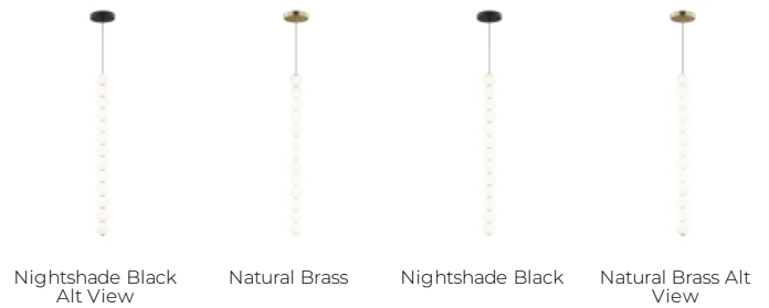
Nightshade Black Alt View

Includes 18.9 watts, 1196 total delivered lumens, 90 CRI 2700K LED modules. Dimmable with most LED compatible ELV and TRIAC dimmers. Ships with 12 feet of field-cuttable matte black cord. 120V-277V