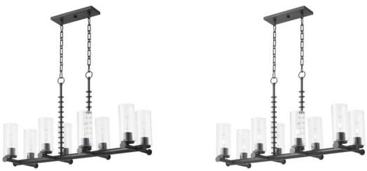
ADDITIONAL FEATURES: Rectangle Hinge Chain