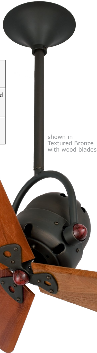
shown in Textured Bronze with wood blades