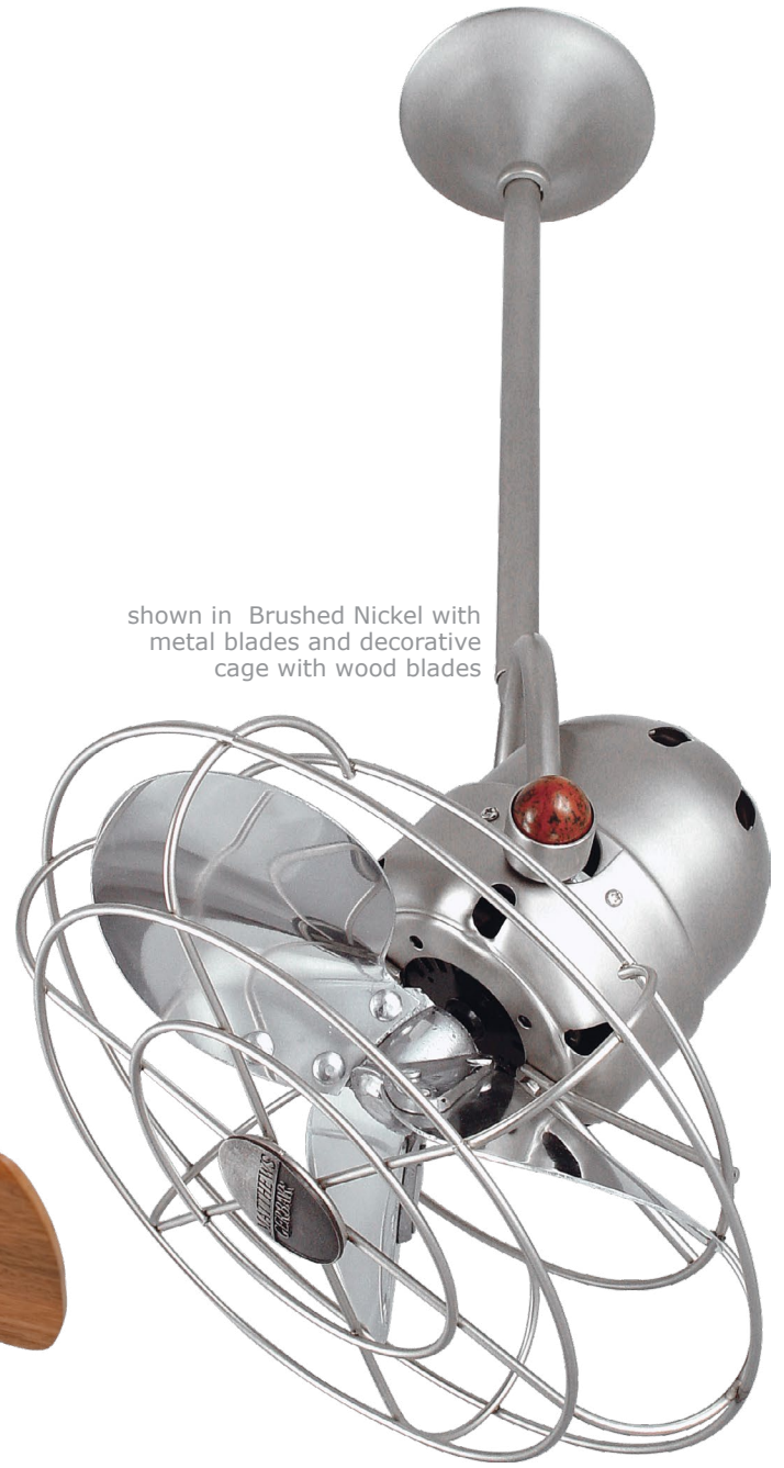
shown in Brushed Nickel with metal blades and decorative cage with wood blades

Unique and versatile, the fan head of the Bianca Direcional ceiling fan can be infinitely positioned in a 180-degree arc, forward and reverse, to provide maximum, directional airflow. The Bianca can be hung in small, awkward spaces or in front of HVAC ducts to make more efficient the heating, ventilation or air conditioning of any room. Constructed of cast aluminum, heavy spun and stamped steel, the Bianca Direcional carries a limited lifetime warranty.