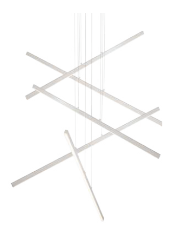
BN - Brushed Nickel