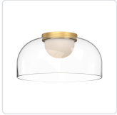
FM52512-BG/CL Brushed Gold/Clear

The charming Cedar Collection is filled with whimsical frosted glass diffusers resting inside clear glass shades. This versatile family includes a variety of different mounting options that can be mounted up, down, horizontally, or vertically. The metal base details offer a nice rigidity that compliments the soft curves found on the rest of the piece and are available in two finishes.