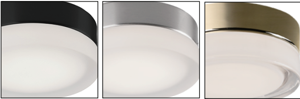
BK - Black