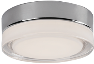
CH - Chrome