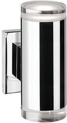
CH - Chrome