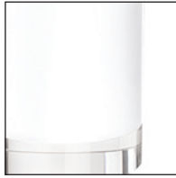
WH - White