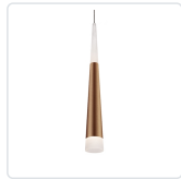
402501VB-LED Vintage Brass