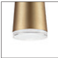
VB - Vintage Brass