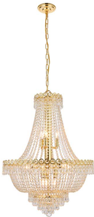
Gold Item No: V1900D24G