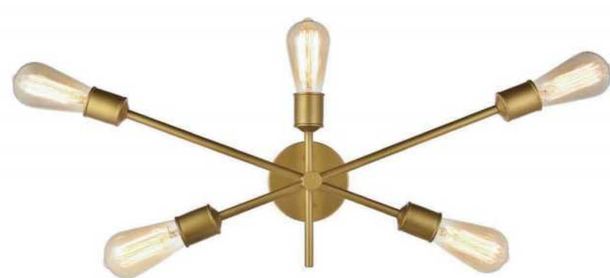
Brass Item No:LD8022W24BR