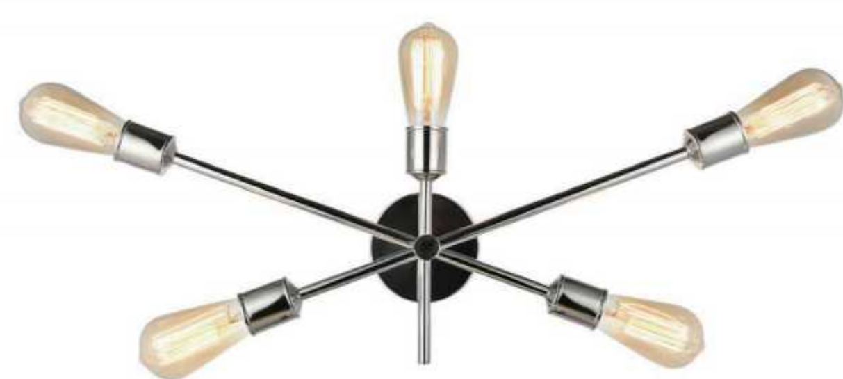
Polished Nickel Item No:LD8021W24PN