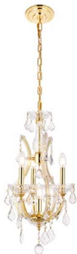
Gold Item No: 2800D12G