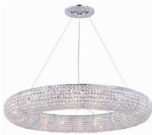
Chrome Item No:2114G59C/RC