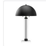
TL565019MB Matte Black

*For complete warranty terms, please visit: www.aloralighting.com/warranty